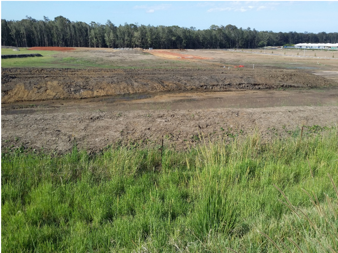
Wholesale large scale tree felling in new developments