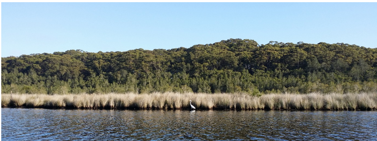
Wholesale clearing of an area like this, west of Lake Cathie - marked for investigation as residential in Council's Draft UGMS