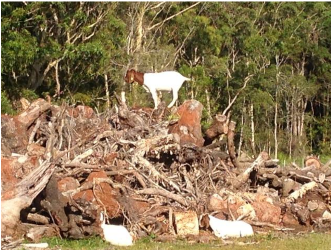
Old growth logging of wildlife habitat to support an unviable goat farm in Bonny Hills