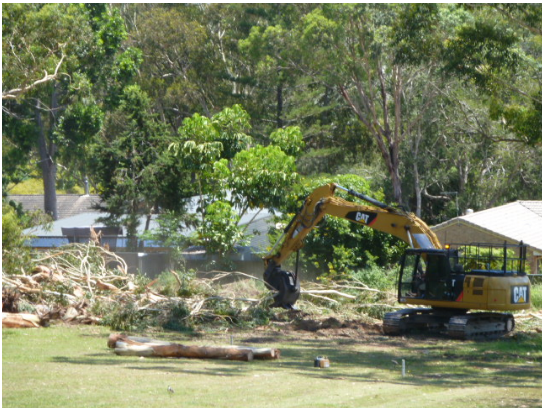
Wholesale tree felling in developments infilling existing residential areas